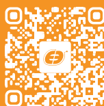
PLUG CHARGER 40 60